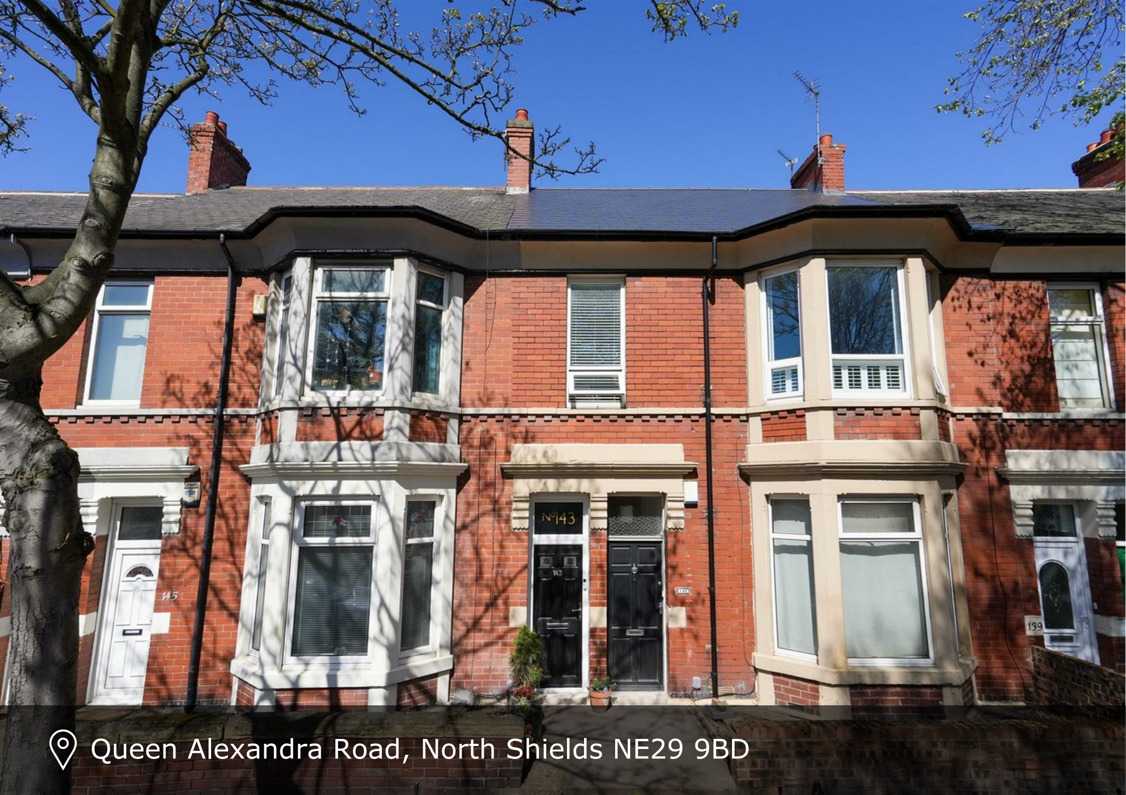
📍 Queen Alexandra Road, North Shields NE29 9BD